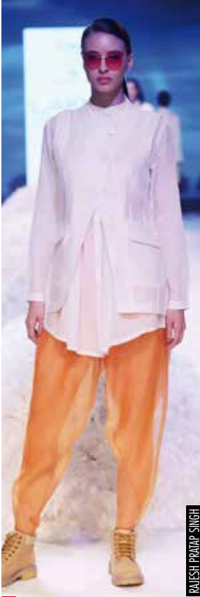
RAJESH PRATAP SINGH

► The Tencel fabric came alive on the ramp for the Rajesh Pratap Singh creations. The 100 per cent Tencel yarns were blended with silk and stainless steel in eye-catching weaves like hopsack, waffle and herringbone. The fabric presented Tencel in an amazing array of options by using hi-tech, airjet shuttle-less and powerlooms to traditional handlooms.