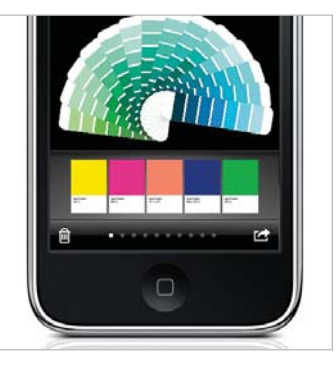
myPANTONE<sup>™</sup> iPhone<sup>®</sup> App