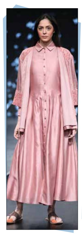
DHI BY ANJANA BHARGAV AND ANKITA BHARGAV MEATTLE

This was a collection that worked with zero waste for the traditional lehengas with sustainable Indian fabrics and weaves that were turned into modern day classics.