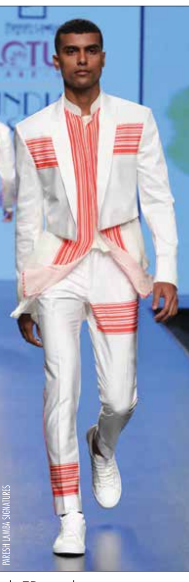
The Lotus Makeup India Fashion Week Spring / Summer 2020 in association with EBixcash was held at the Major Dhyan Chand National Stadium in New Delhi from October 9 to 13, 2019 where designers unveiled collections for the coming season of 2020.

The fabric choice of the designers was varied as traditional Indian textiles were used with organic fabrics as well as recycled plastic PET bottles—turning them into fashion textiles that will be seen in 2020. Broadly, when it came to colours white played an important role for the summer heat of India while multi-coloured hues of the rainbow were favourites. Prints were exotic with flora and fauna being great inspirations along with embellishments that appeared to add a great sparkle to the ensembles. Meher Castelino reports.