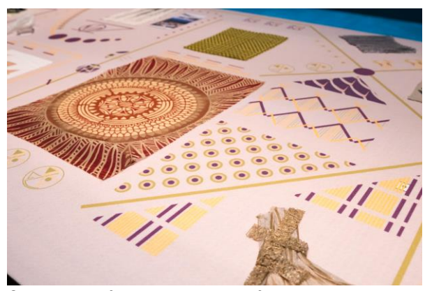
Overprinted fabrics in bas-relief

This theme is thus a recall to floral décor, Egyptian preciousness, kaftans, golden colours and the interior decorations of Ibizan houses.