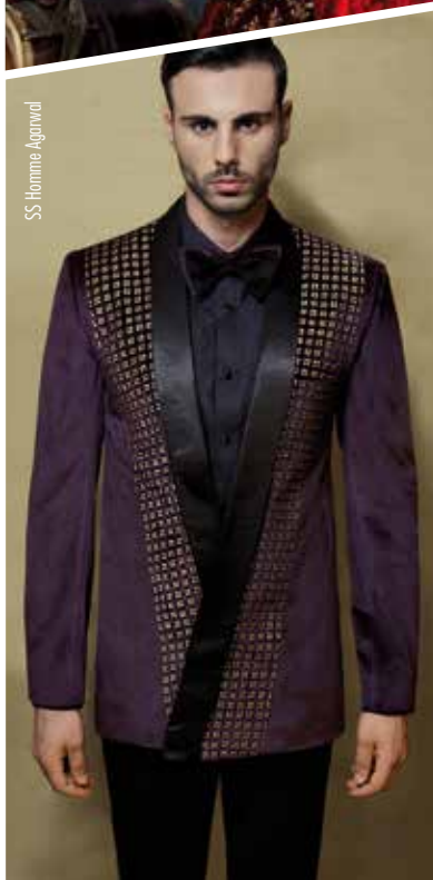
SS Homme Agarwal