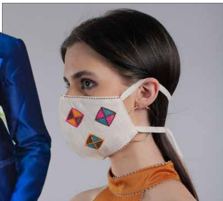
THE WOVEN THREAD / PUBALI SEN