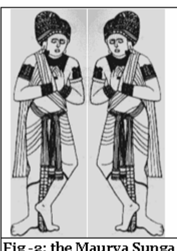
Fig -2: the Maurya Sunga Period 371 BCE to 72 BCE

With the coming in of Islamic rule from 8th Century AD, Medieval India saw a lot of change in costume and culture. This change can be seen in the characteristic architecture and painting depicting contemporary costumes. With the establishment of Mughal rule, a blend of Persian and ancient Indian artistic sensibilities can be seen in art, architecture and clothing. With the Persian influence, the majority of stitched garments entered India, the antariya was replaced by the Pyjamas or costumes for the legs, which were of a various