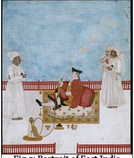
Fig 5: Portrait of East India Company official 1760 to 1763 CE

under the leadership of Robert Clive started showing more interest in governing the country rather than merely trading. This resulted in heavy economic losses, and eventually Indian Governance was taken over by the British Imperial court and came directly under the rule of Queen Victoria. It was then that the terminology of Raj (the word for Rule in Hindi) came to be associated with the British.