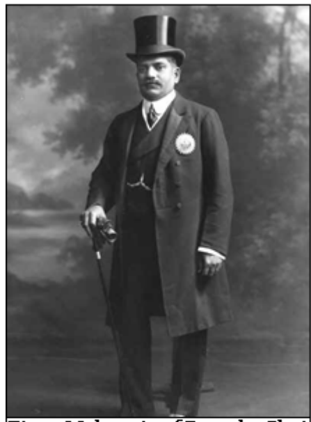
Fig 7: Maharaja of Baroda, Shri Sayaji Rao Gaekwad in 1910 CE

Another voluntary change was when the Hindu women (especially from Bengal and south India) under the western influence felt uncomfortable to wear only sarees, thus they took to wearing jackets or blouses even jumpers, along with