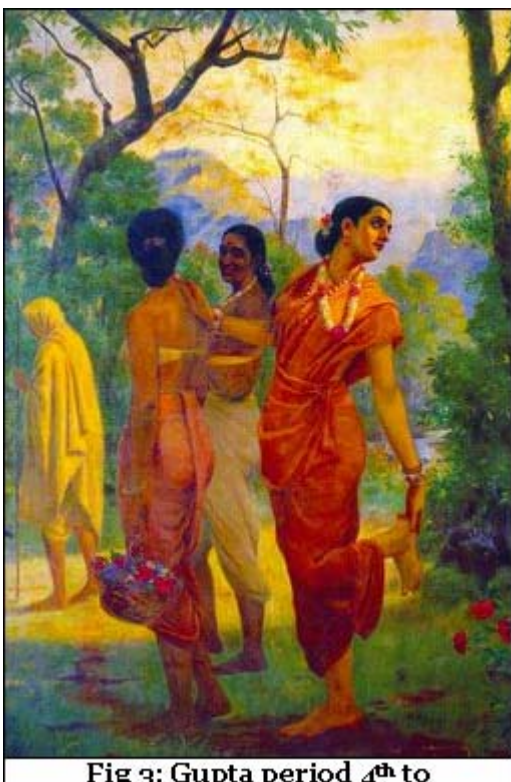
Fig 3: Gupta period 4th to 8th Century AD

Owing to climatic conditions people took frequent bath in summers, rectangular pieces of cotton fabric were easy to maintain, breathable, comfortable and in all ways multipurpose. Though beautiful Silk fabrics were made, they were not for everyday use of the common man.