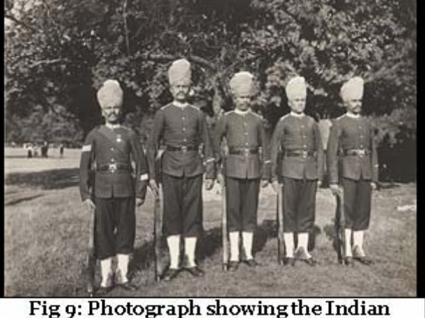
Fig 9: Photograph showing the Indian Army (Indian coronation troops – Aug 1902)

Slowly and steadily even after the Indian independence the majority of Indian men and women changed their dressing habits at least in public, to the modern western styles in order to appear forward thinking and forward moving.