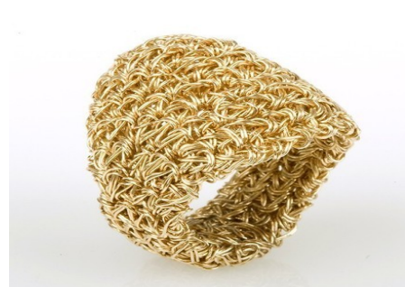
Knitted ring with gold wire

When making wire jewellery, different effects can be achieved by introducing new and unusual wire working techniques. If you are used to wire wrapping or other wire jewellery making skills, it can be considered taking a look at crafts traditionally more thought of as textile crafts, for instance crochet and spool knitting.