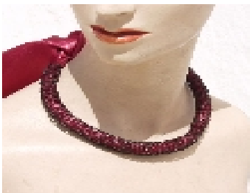
Tube With Ribbon (Necklace)

Spool knitting: Spool knitting is another interesting technique to explore. It is in trend with gold wire as well thread, as You may remember as a child working with a 'Knitting Nancy' or perhaps a wooden cotton reel with a few pins knocked into the top. By working the wire around the pins a long tube is formed. This can then be drawn through a draw plate to pull the braid into shape and to even it out. Different effects can be achieved by working on all or just some of the pegs. If a peg is left free then a 'ladder' is formed and this can be used to weave material through or can be pulled into different shapes. When spool knitting with wire, it is best to start with waste yarn, work a few inches of tube and then join in the wire.