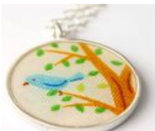
Pendant with embroidered fabric scrap

Textile scraps have many creative uses if a designer uses his/her imagination. One can make gorgeous, colorful, and tangible wearable works of art from recycled pieces of fabric and textiles. One interesting use for small bits of fabric is making fabric beads, which get incorporated into beautiful fabric or textile jewellery that is sure to earn compliments to wearer. The beautiful extracts of embroidered or basted fabric pieces can be embedded in various metals to form a delightful pendant. These are then worked on with various embroidery and beading techniques to create the finished textile jewellery pieces.