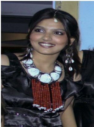
Jewellery with cotton fabric scrap

colour. As it gives an original jewellery look.