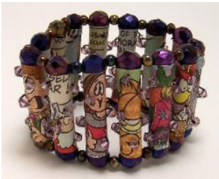
Swatches Strip Bracelet

Innovation: To accomplish something special it is good to understand what kind of new process can be performed on that material so that one can achieve unique forms and details. Innovation takes a whole new meaning. The scope to innovate becomes vaster through new way of combining waste/scrap fabric material that can give a novel look to jewellery.