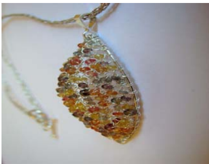
Spool Knitting With Beads

Now Silver and Gold threads are also used to create fine jewellery. The strength and flexibility of fine plated wire to create a knit for artisans to make jewellery never before possible! The surface of the wire is covered with poly-nylon which prevents tarnishing! You'll find it suitable for designs which are delicate, supple, light and bright