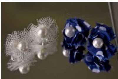
Earring with Soft Fabric

One can even go for antique fabric pieces, which fortunately comes at an affordable price as well. An antique piece has its very own unique style, most of the time it has been hand crafted as per requirement of customers. By using these antique fabric pieces one can create beautiful jewellery pieces, these traditional Indian ornamentation are antique in so many ways, they add weight to wearer's dressing. A beautiful range of Indian antique finery & jewellery is now available at world market, which consists of antique as well as modern designs