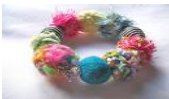
Decorated Fabric Bracelet

Choice of material: One needs to keep in mind while collecting the scrap textile; it should be durable and complement the look that one is trying to express. If it is according to a particular theme then other materials i.e. wood, stones, finding, glass beads crystal, shells etc might be a good option to combine with precious or artificial metal. Beads among all the materials are a fascinating option can be used with very effectively in almost all type of scrap material. A Pack of jump rings will also be needed to connect jewellery components. One can opt to buy metal-based Jump rings, as they are less expensive. A little silk thread or other beading strings that are pliable can also be of big help in formation of textile scraps.