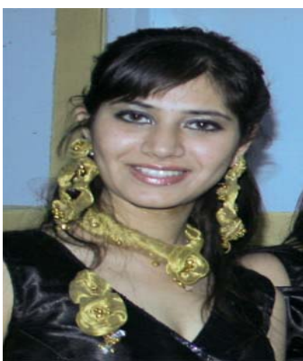
Jewellery with tissue fabric scrap

Today, the choice of materials or metals used by designers depends absolutely on the price factor. This idea revolves around mixing the inexpensive with the exotic, as it creates an interesting mix. Therefore, if a customer is looking for new and unique designs, an unusual combination of textile scrap materials could do the trick. Looking at affordable materials while designing jewellery, some alternatives could be used likewise large colored stone beads, enamel, wood or silver findings to form the base of textile scrap material. Basically, the choice of materials used for creating ornaments is usually theme-oriented. For instance, for a floral inspired collection, 'waste tissue fabric' can be opted, with an exclusive golden