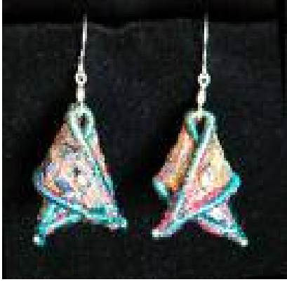
Textile scrap earring