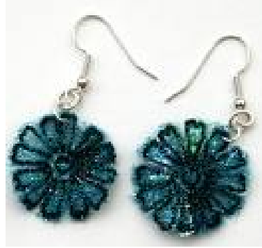
Earring with Embroidery scrap