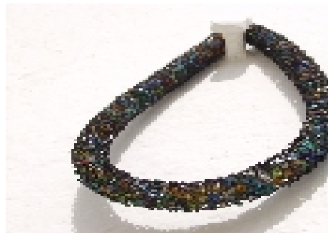
Crochet Tube with Beads