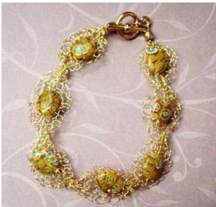
Wire Necklace With Beads

The new design proposals are based on selected classical and traditional local designs, created in the traditional handicraft manner. Using these Unusual Techniques can Bring Something Different to fashion Jewellery world. Explore new and different techniques to your jewellery making. Traditional textile techniques lend themselves to wire work and create a whole new range of opportunities.