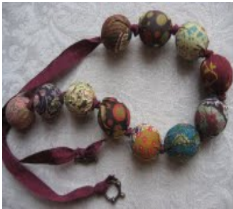
Necklace with fabric beads

Designers express their creativity through their unique work of art, by transforming fabric scrap into fashion accessories. They are proud to showcase the creativity and resourcefulness through the use of scrap materials for jewellery, At this point fashion & jewellery designers have much hand-on experience in jewellery and much knowledge of the technical challenges.