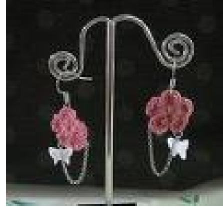
Knitted thread earring