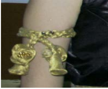
Antique – Adorable Armlet

One can even go for antique fabric pieces, which fortunately comes at an affordable price as well. An antique piece has its very own unique style, most of the time it has been hand crafted as per requirement of customers. By using these antique fabric pieces one can create beautiful jewellery pieces, these traditional Indian ornamentation are antique in so many ways, they add weight to wearer's dressing. A beautiful range of Indian antique finery & jewellery is now available at world market, which consists of antique as well as modern designs