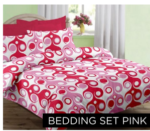
BEDDING SET PINK