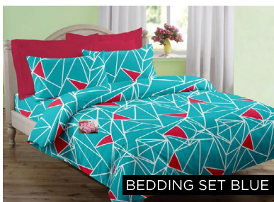
BEDDING SET BLUE